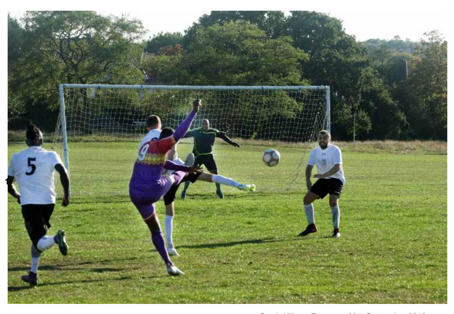
South Kilburn Reserves 29th September 2018