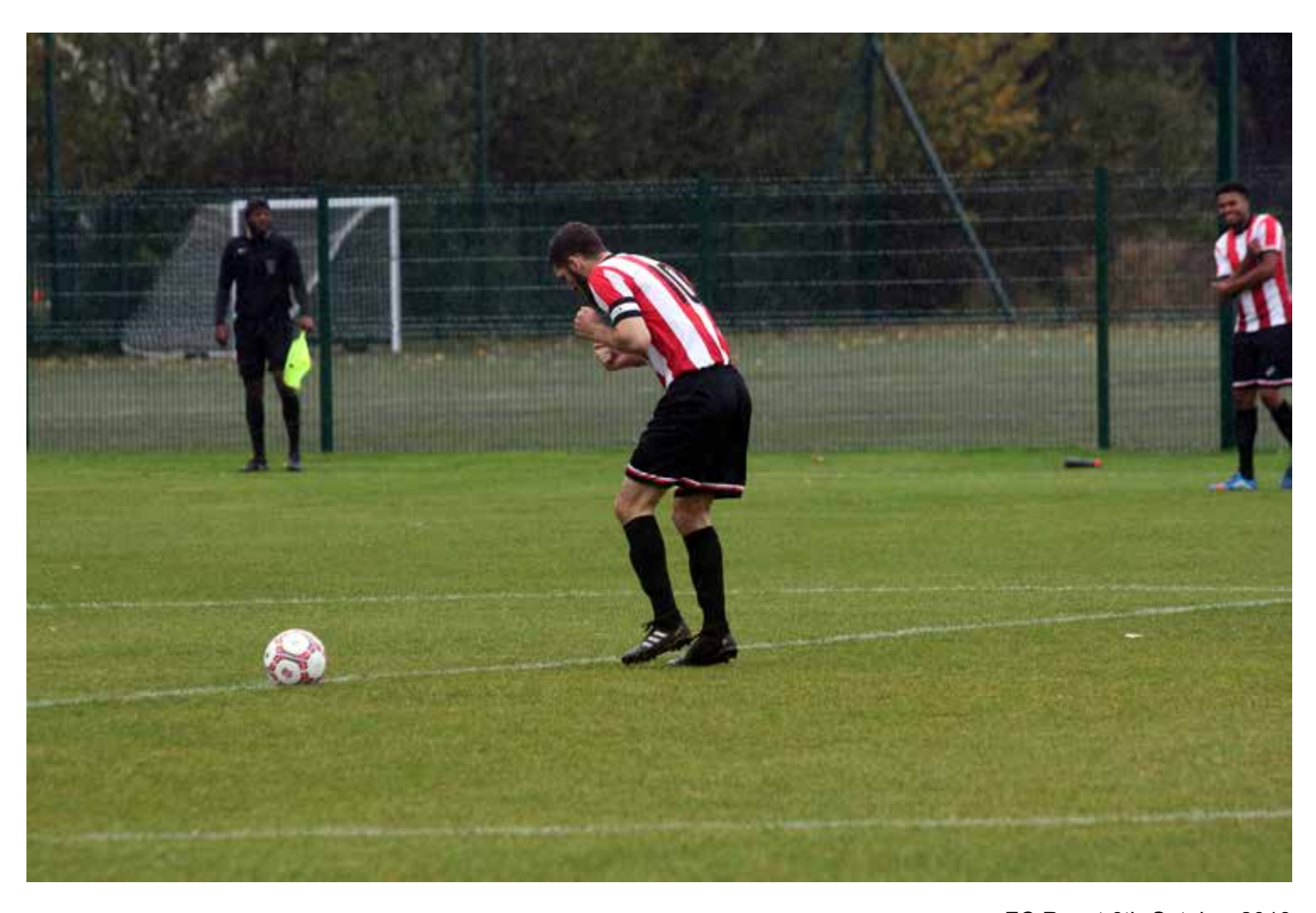
FC Roast 6th October 2018