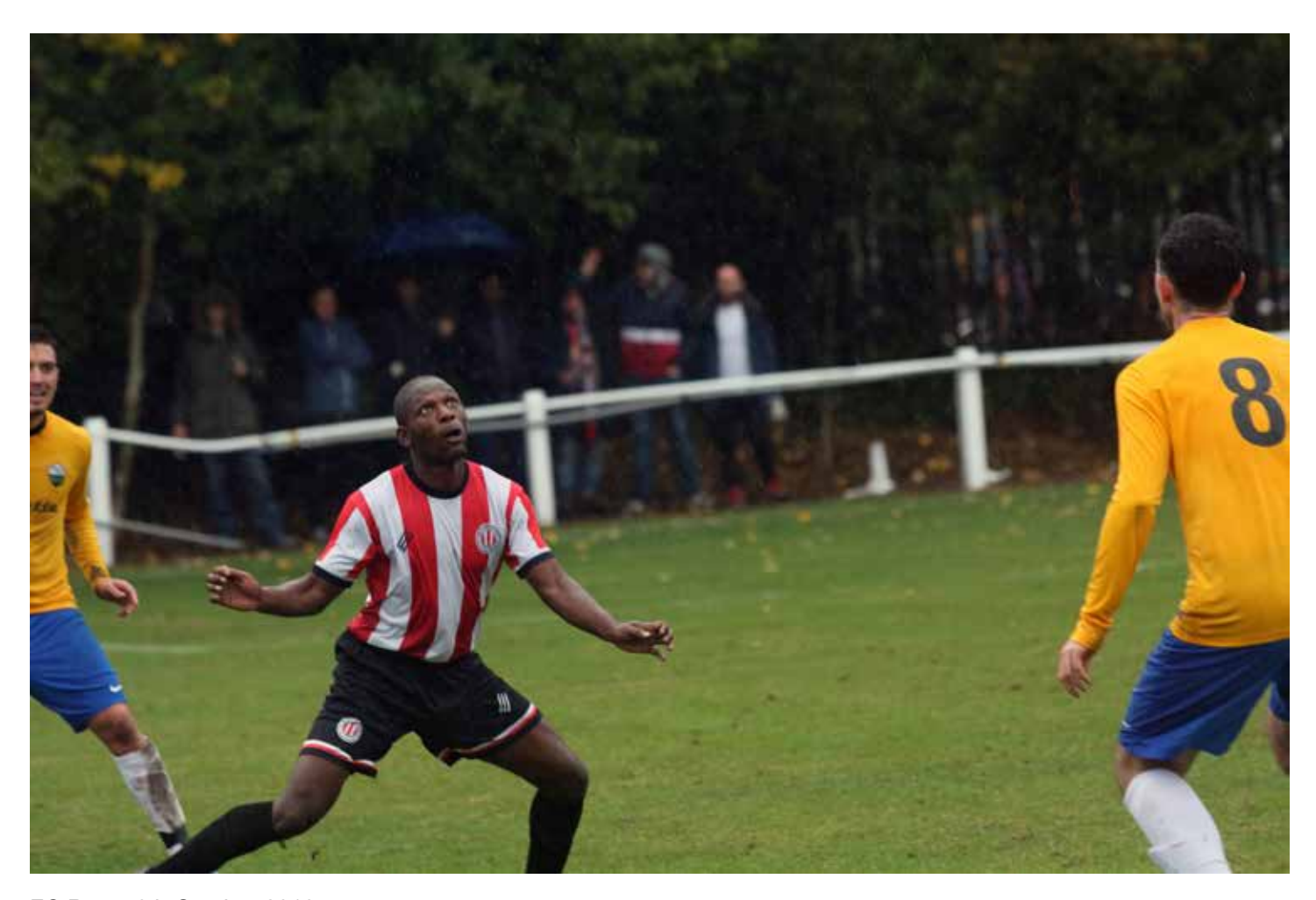
FC Roast 6th October 2018