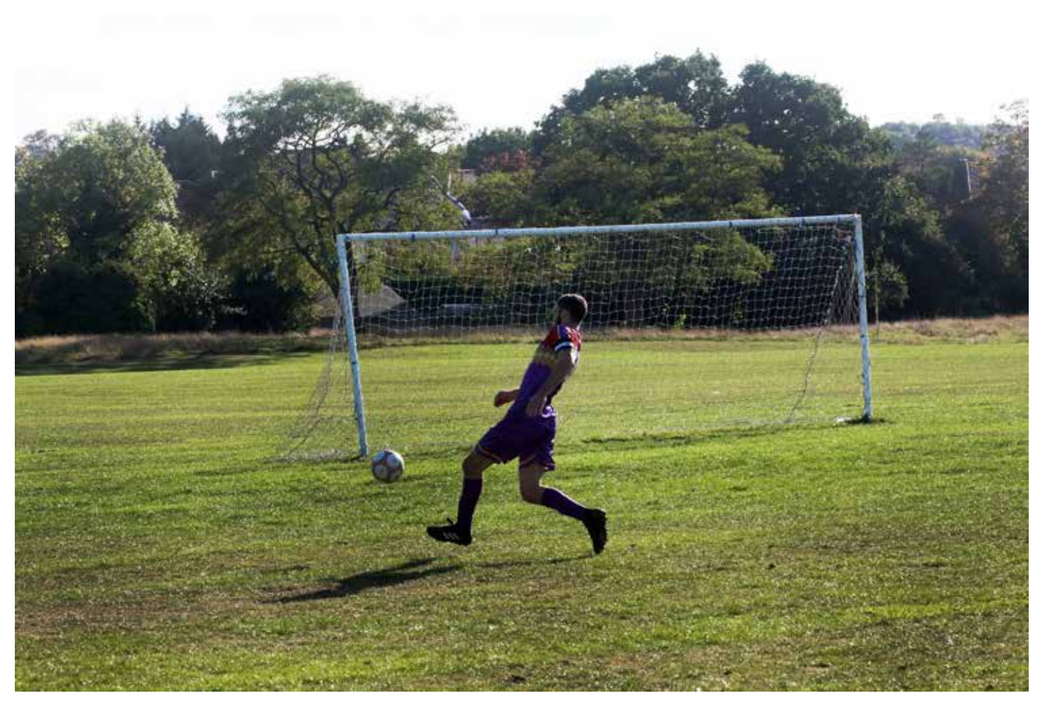
South Kilburn Reserves 29th September 2018