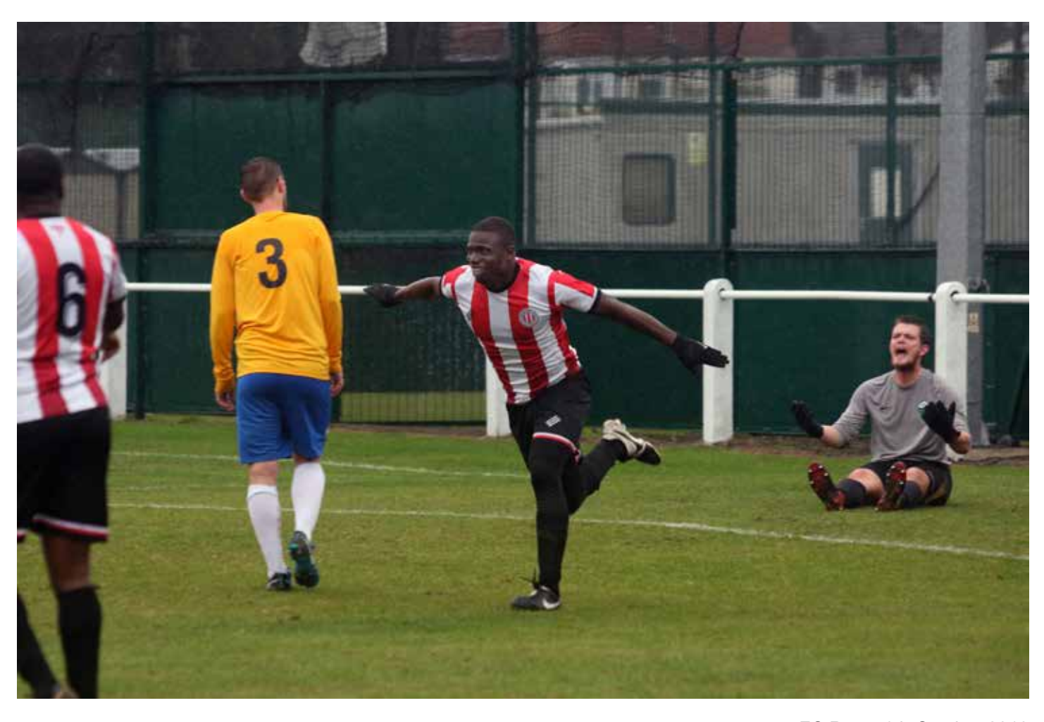
FC Roast 6th October 2018