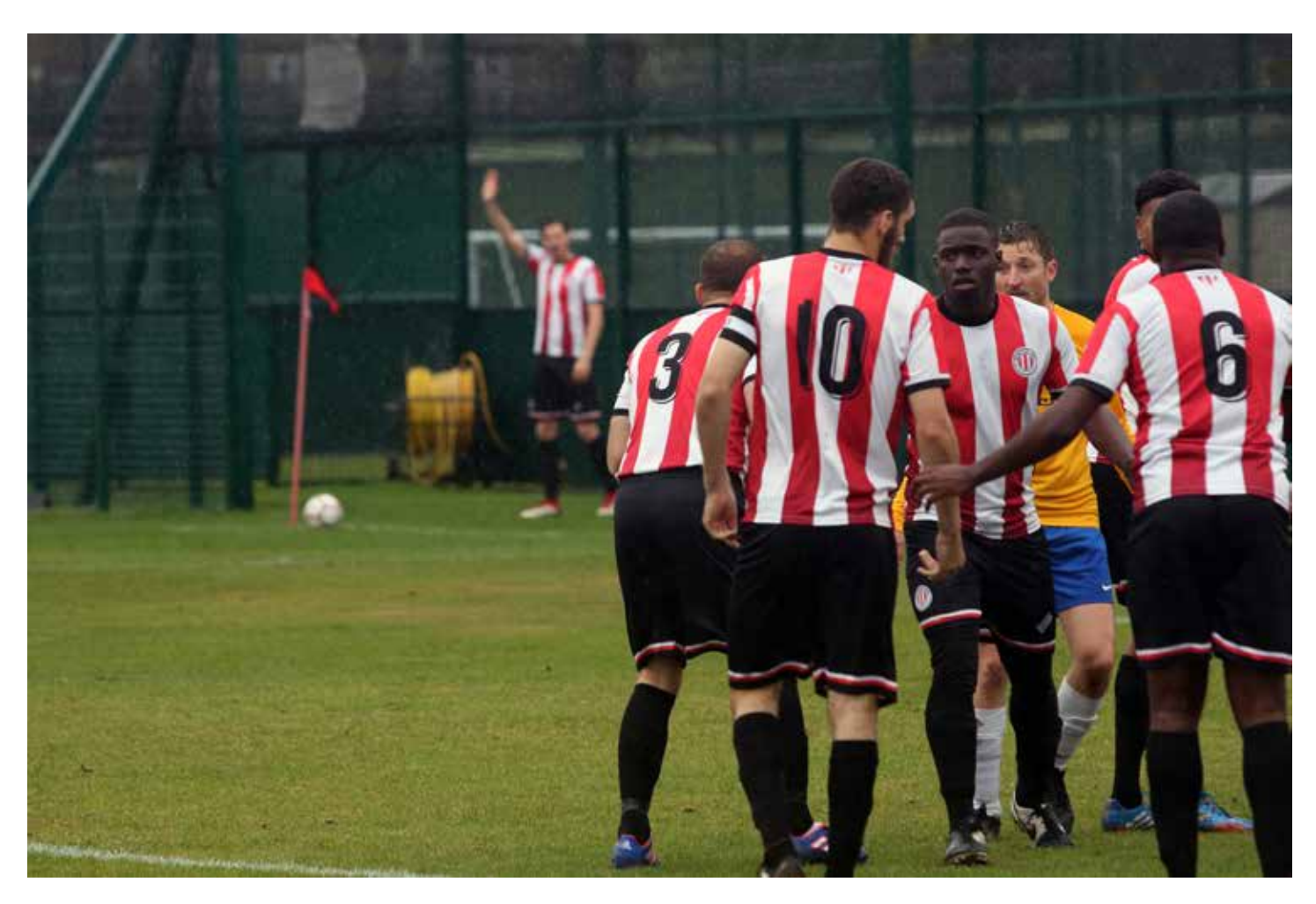
FC Roast 6th October 2018